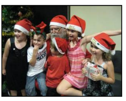
A very popular Santa at our Sailing Club Christmas party