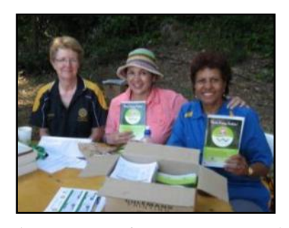
A happy trio of 'Gate Keepers' doing duty at the Gardens Spectacular