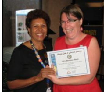
Ainslie was just one of 13 members to receive 100% Attendance Awards.