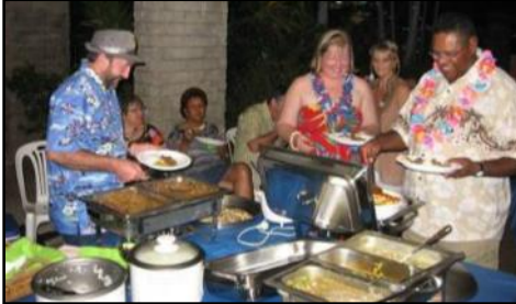
A Club Progressive dinner what a great fun way of raising money.

Selling raffle tickets at the Parap markets an easy $3000 fundraiser